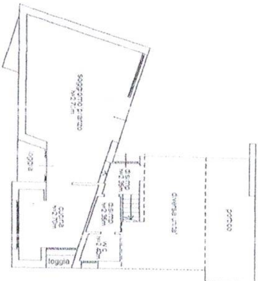
PIANTA PIANO TERRA